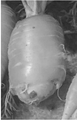
Figure 1. Example of an underdeveloped root.