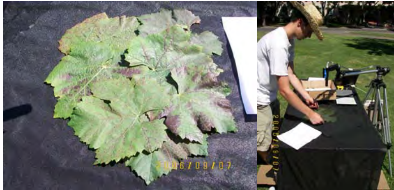
Figure 1: Leaves with 10-20% K deficiency symptoms (left), ASD field spectrometer (right).

1, left). The background cloth was move through the spectrometer field of view (FOV) for collecting 4 to 8 spectra measurements per leaf cluster. Each measurement was the mean of 3 spectral collections. The leaf reflectance was measured with an ASD Field Pro full range spectrometer (Analytic Spectral Devices, Boulder, CO) under full sun conditions at UC Davis on 11 September 2006 at one hour past solar noon (between 2:00 and 2:45 pm, PDT). The optical cable was affixed nadir on a tripod extending arm with a FOV of approximately 9 cm, under an 18 degree foreoptic on the tip of the optical cable. Before and after collecting leaf spectra, a series of Spectralon calibration panels, 0.99, 0.50, and 0.10 reflectance, (Labsphere, Inc, North Sutton, NH) were measured for post-calibration. The measurements were made rapidly to minimize water loss (Figure 1, right).